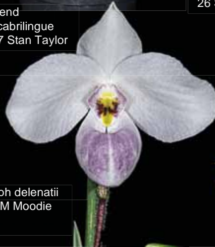
Paph delenatii 28 M Moodie