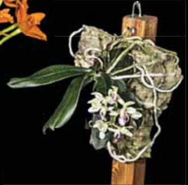
Aerides japonica 25 Stan Taylor