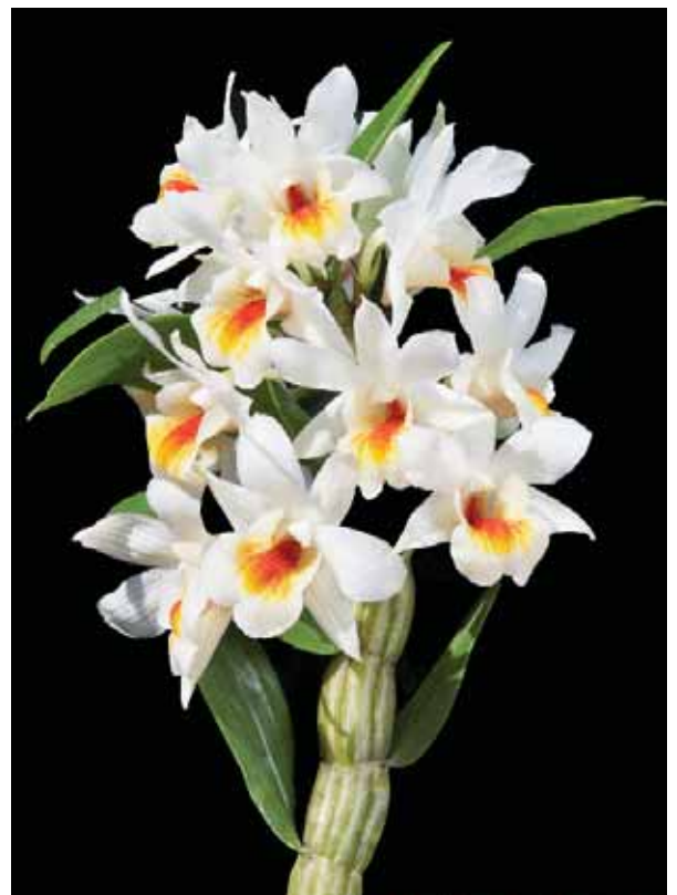
Dend. Dawn Maree x christyanum

Thanks to everybody that took the trouble to enter their photographs and make the afternoon voting so interesting.