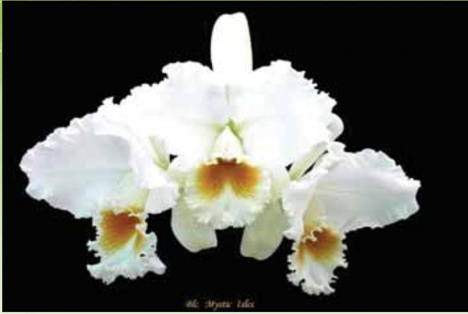
Blc. Mystic Isles