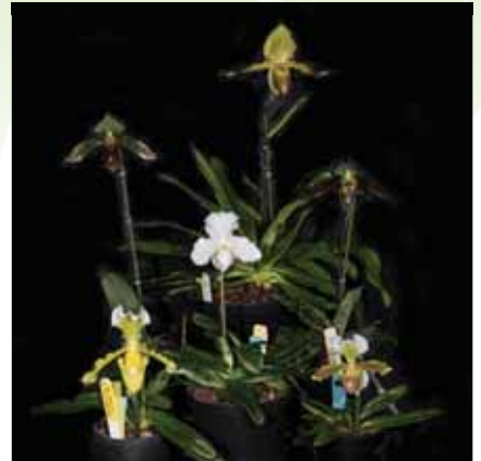
Class 1 – Malcolm Moodie