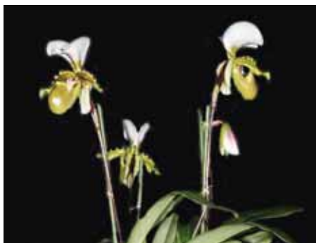
Paph. spicerianum – Malcolm Moodie