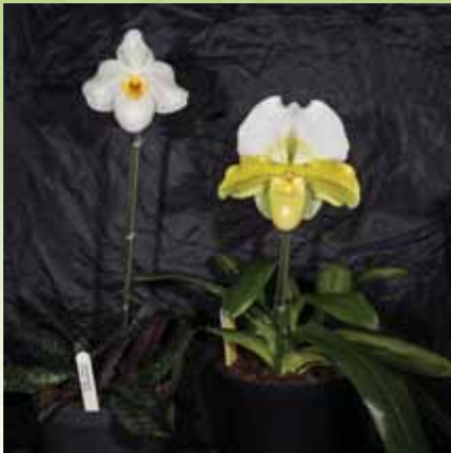
Paph. Armeni White & Buckhurst – Malcolm Moodie